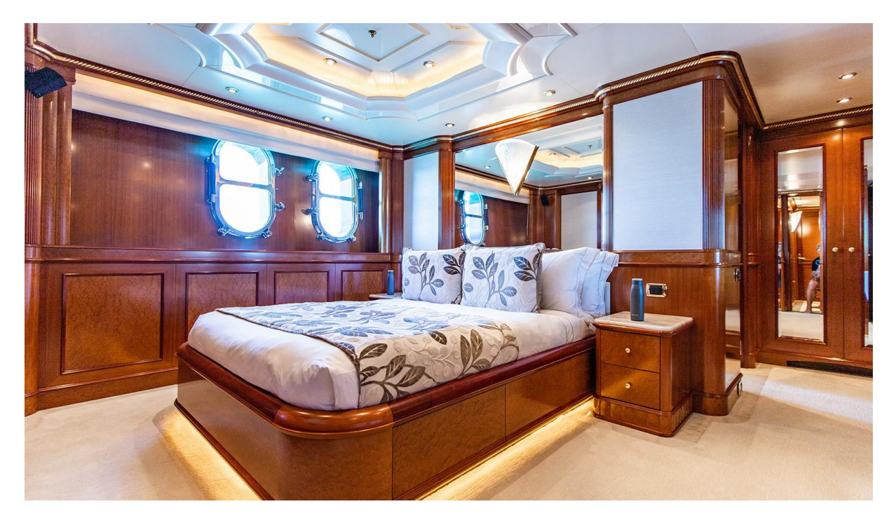
NEXT CHAPTER 180'6"/55m Benetti 2003/2022 - Twin Ensuite