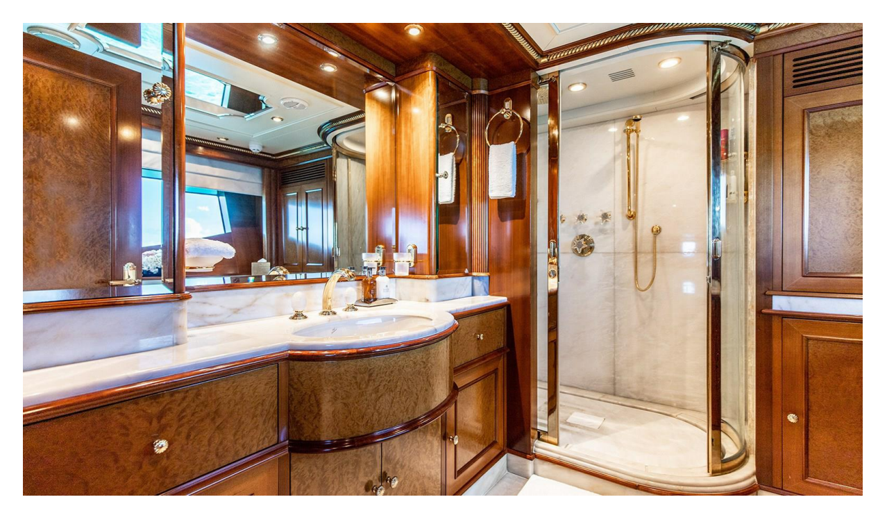
NEXT CHAPTER 180'6"/55m Benetti 2003/2022 - Master Ensuite