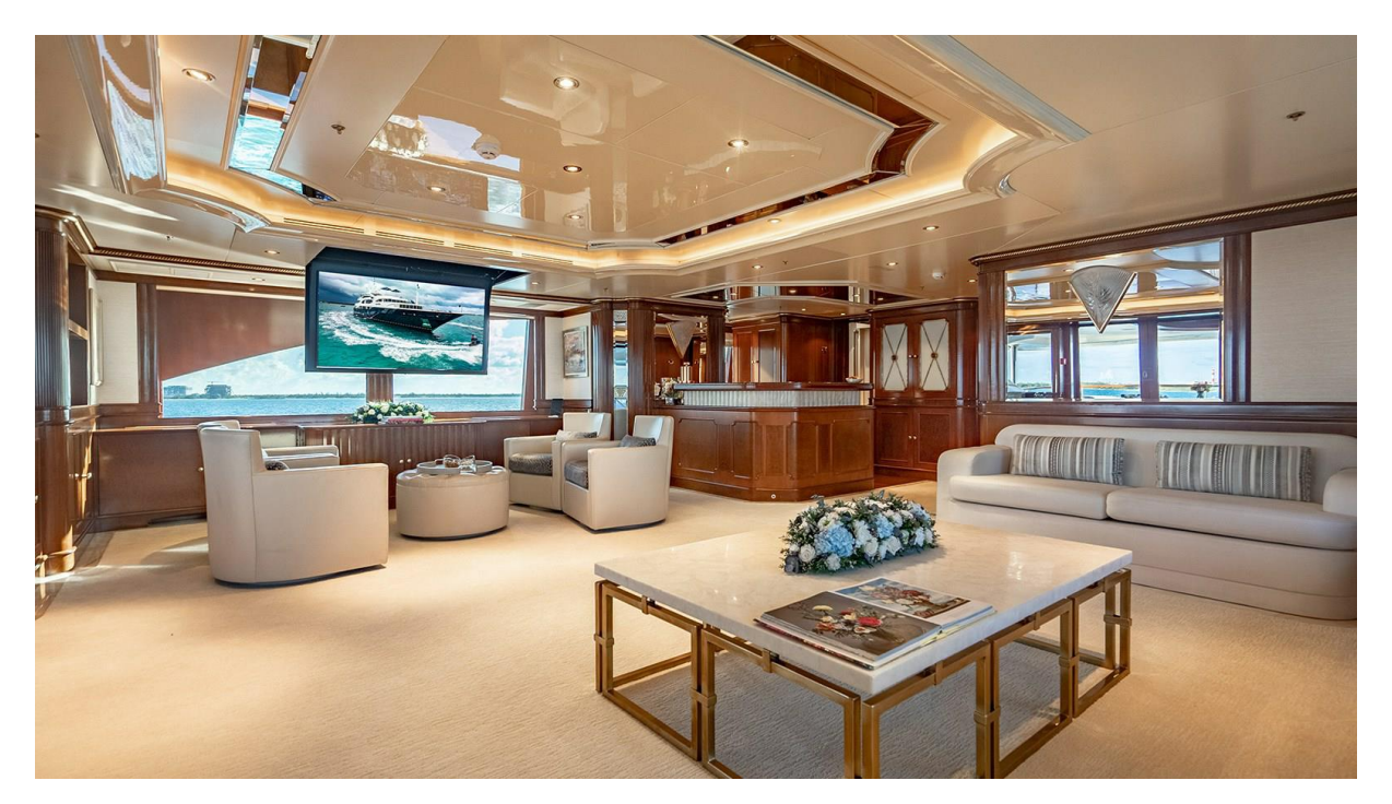
NEXT CHAPTER 180'6"/55m Benetti 2003/2022 - Sky Lounge