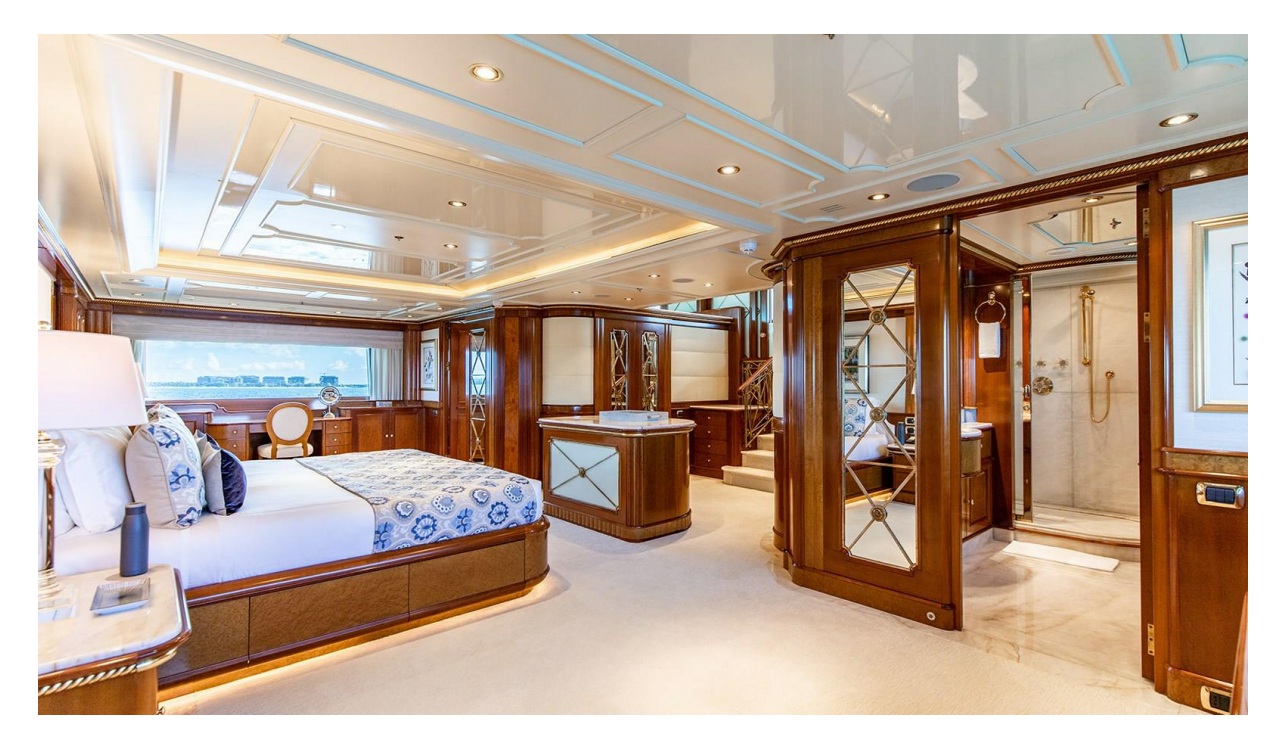
NEXT CHAPTER 180'6"/55m Benetti 2003/2022 - Master Stateroom