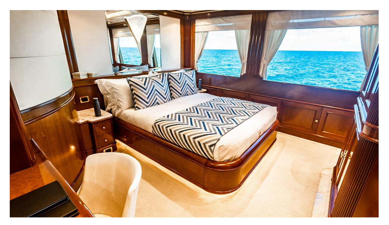
NEXT CHAPTER 180' 6"/55m Benetti 2003/2022 - VIP Ensuite