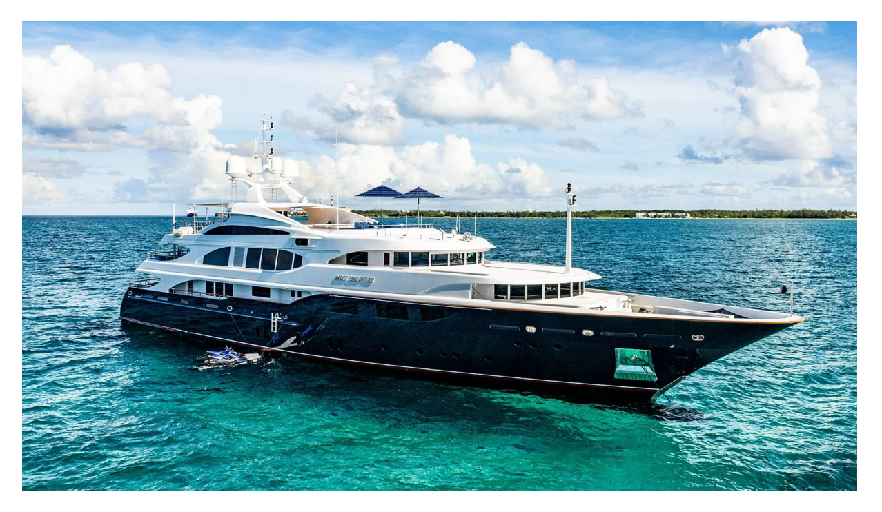
NEXT CHAPTER 180'6"/55m Benetti 2003/2022 - Aerial Jacuzzi