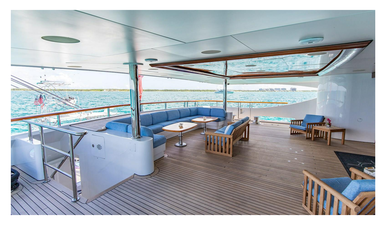
NEXT CHAPTER 180'6"/55m Benetti 2003/2022 - Main Deck Aft