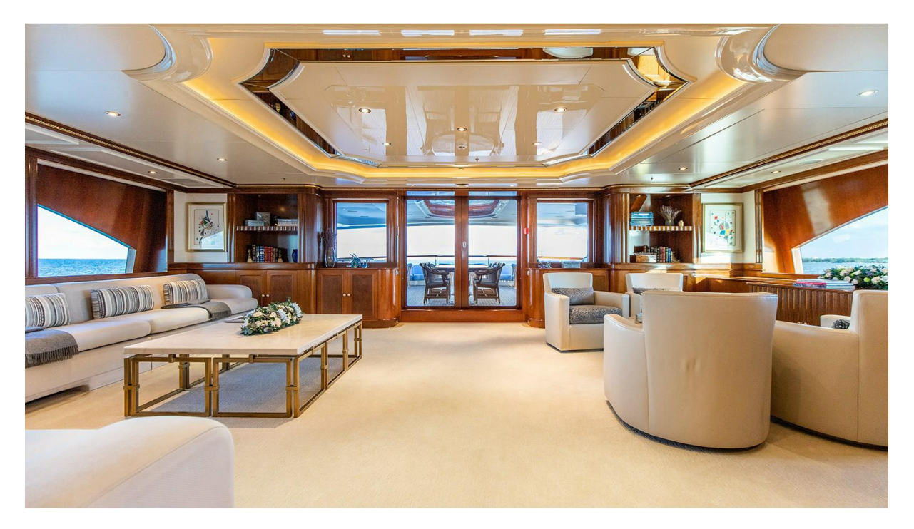
NEXT CHAPTER 180'6"/55m Benetti 2003/2022 - Sky Lounge