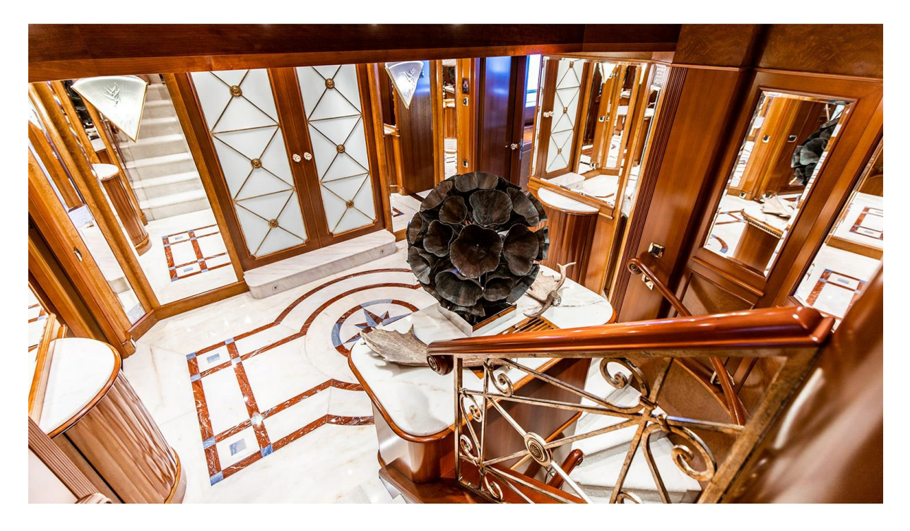
NEXT CHAPTER 180'6"/55m Benetti 2003/2022 - Queen Ensuite

NEXT CHAPTER 180'6"/55m Benetti 2003/2022 - Lower Deck Guest Foyer