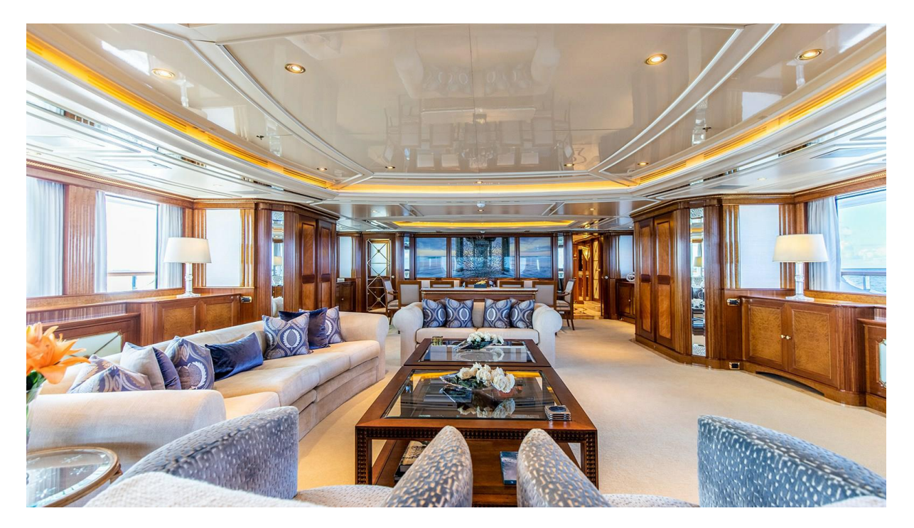
NEXT CHAPTER 180'6"/55m Benetti 2003/2022 - Master Stateroom

NEXT CHAPTER 180'6"/55m Benetti 2003/2022 - Main Salon