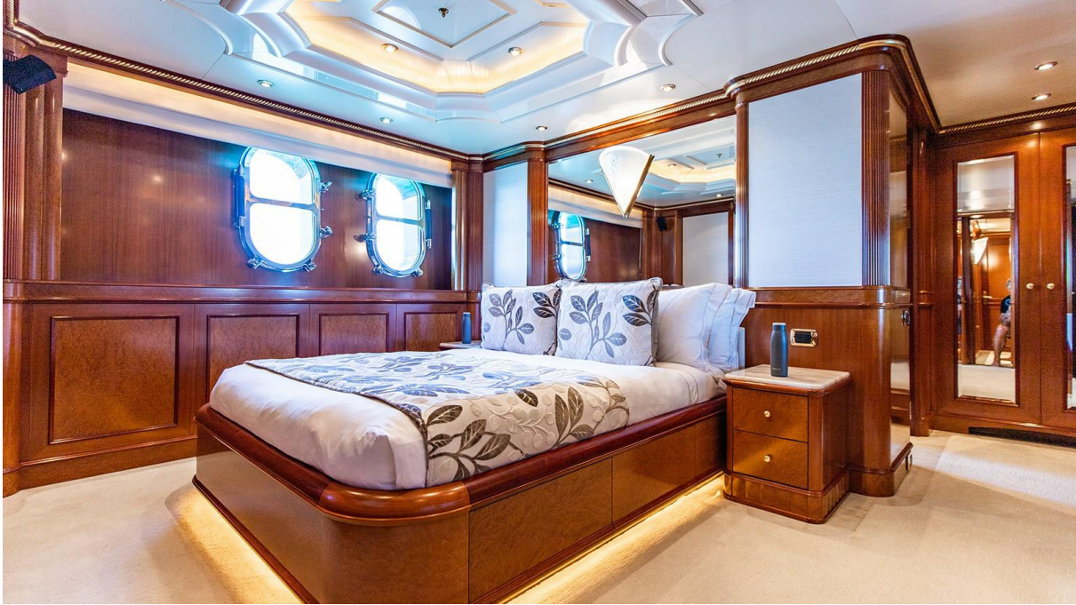
NEXT CHAPTER 180'6"/55m Benetti 2003/2022 - Twin Ensuite