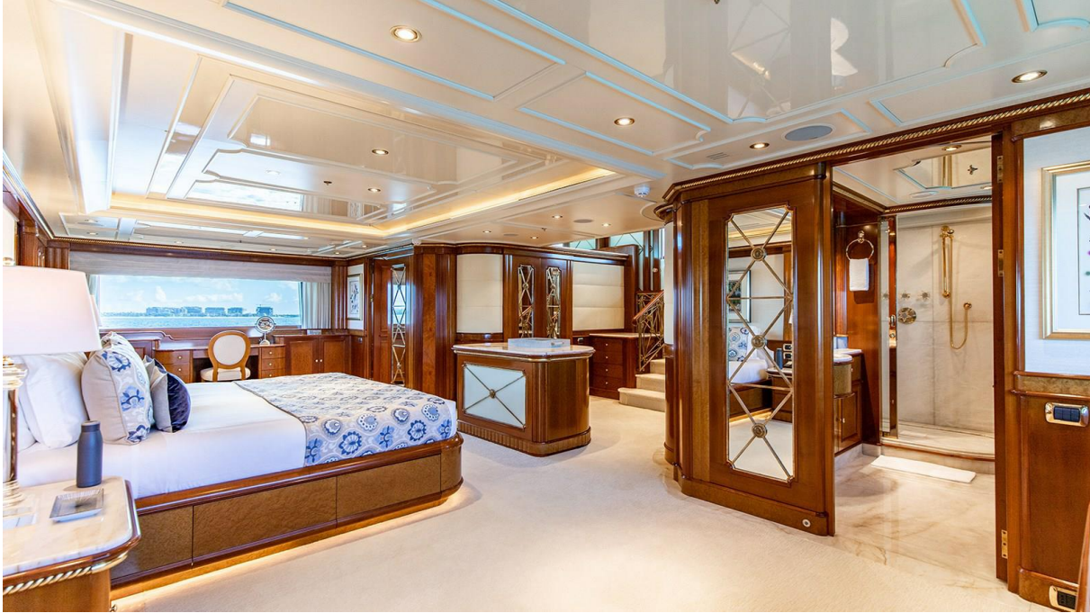
NEXT CHAPTER 180'6"/55m Benetti 2003/2022 - Master Stateroom