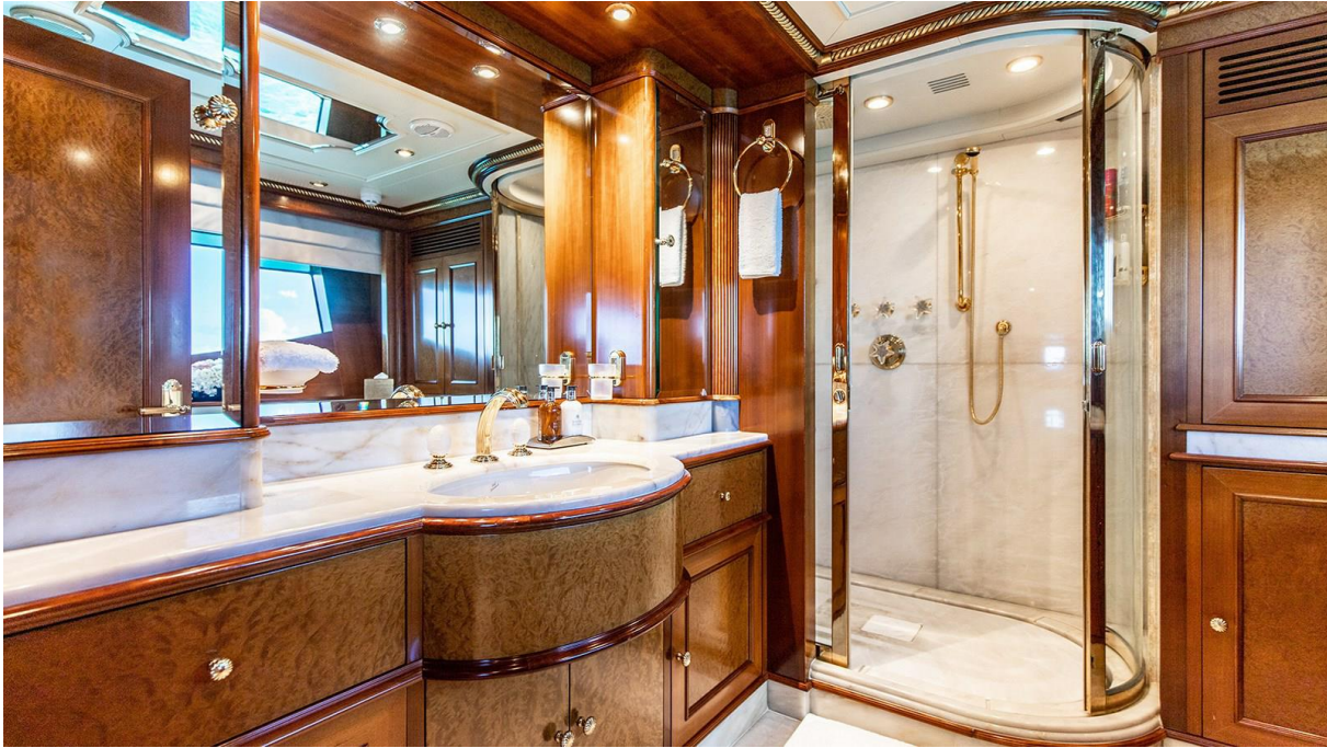
NEXT CHAPTER 180'6"/55m Benetti 2003/2022 - Master Ensuite