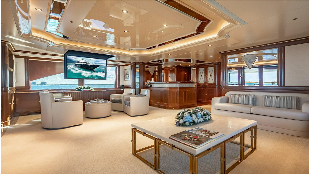
NEXT CHAPTER 180'6"/55m Benetti 2003/2022 - Sky Lounge