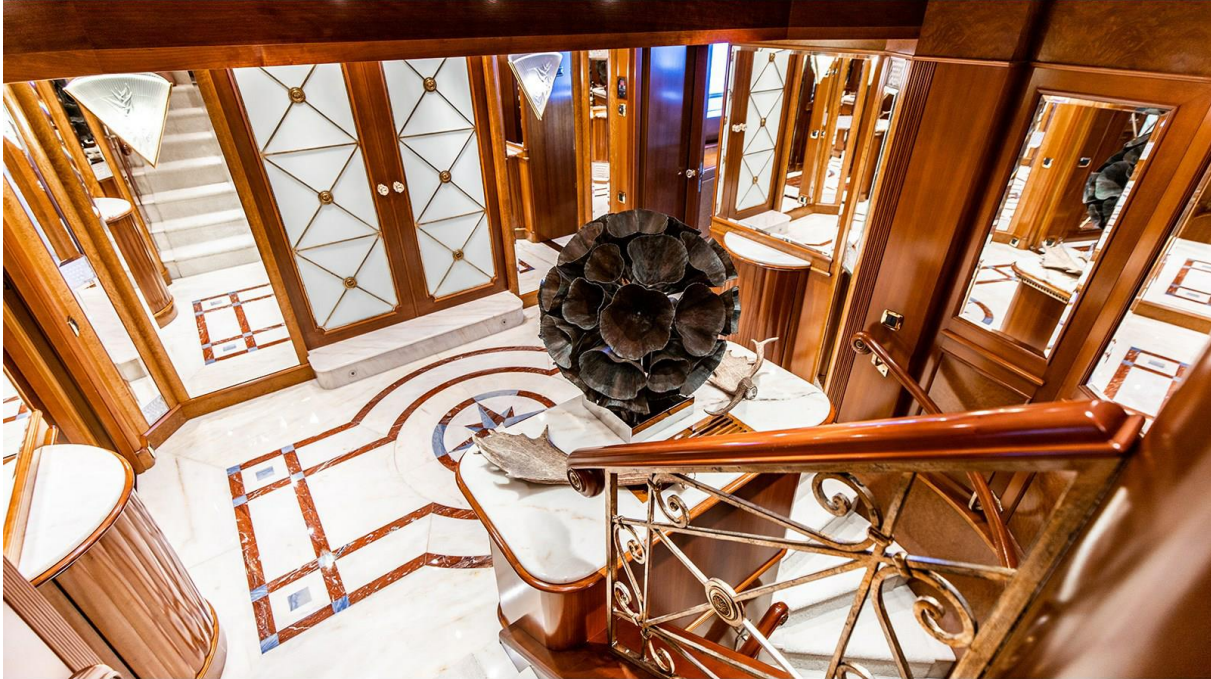
NEXT CHAPTER 180'6"/55m Benetti 2003/2022 - Queen Ensuite