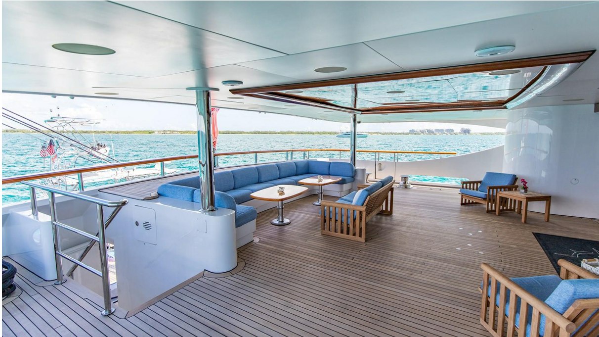
NEXT CHAPTER 180'6"/55m Benetti 2003/2022 - Main Deck Aft