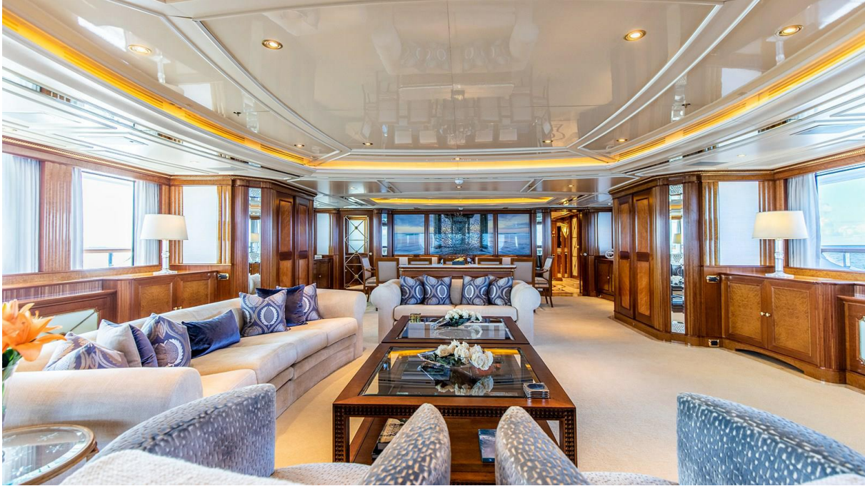
NEXT CHAPTER 180'6"/55m Benetti 2003/2022 - Master Stateroom