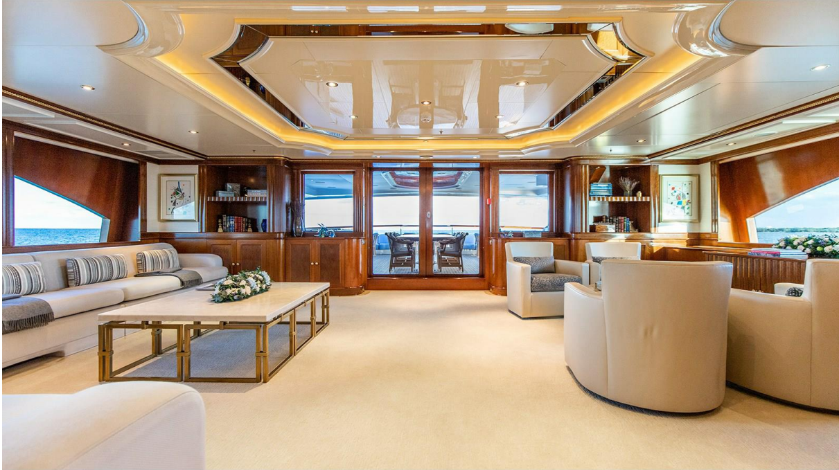
NEXT CHAPTER 180'6"/55m Benetti 2003/2022 - Sky Lounge